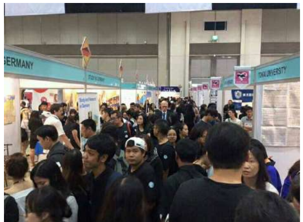
Crowd at the DAAD Information Booth, OCSC International Education Expo

15th November: Information event on "Good Reasons to Study and doing Research in Germany" at Silpakorn Univeristät, Nakhon Pathom