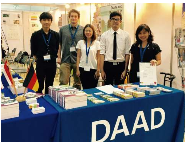
DAAD Staff at OCSC International Education Expo