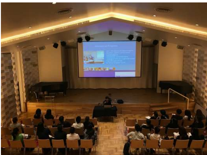
Our monthly Presentation at Goethe Saal, TDKS

27th January: Christiane and Goethe – A Literary Evening performed by students of the universities Chulalongkorn, Thammasat and Silparkorn at Goethe Saal, Thai-German Cultural Foundation (sponsored by DAAD and Goethe-Institut)