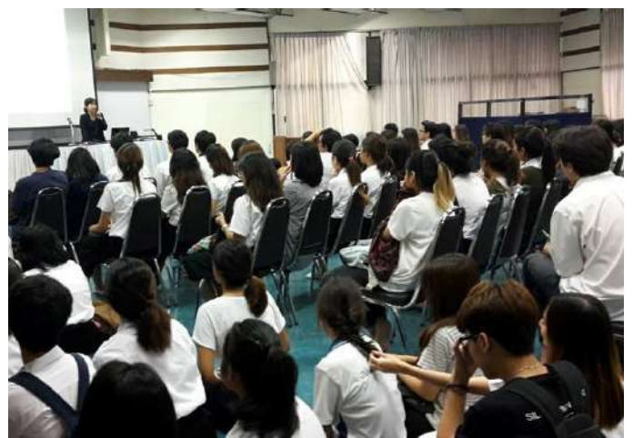
Information Speech at Silparkorn University