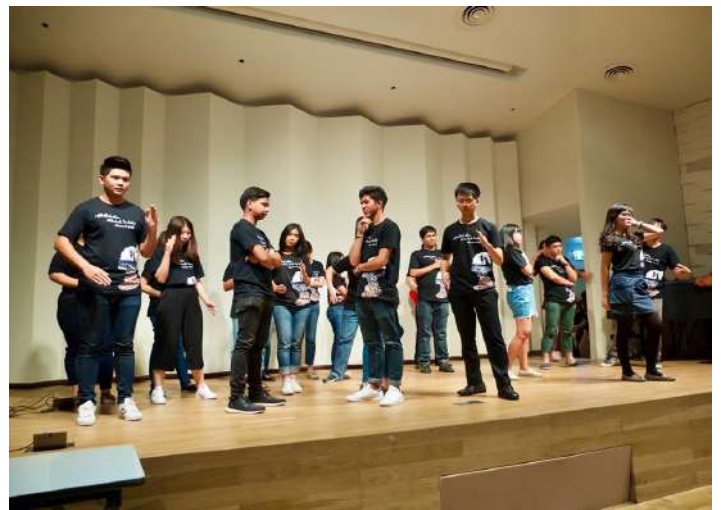
Students performing Goethe poems at the Literary Evening