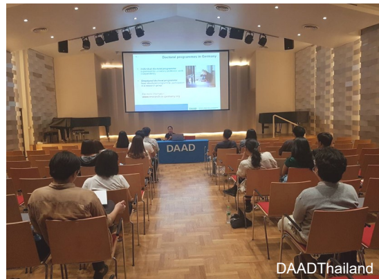
Monthly Info-Session: Study and Research in Germany

We decide to close our office starting from 23 th March 2020 to stay safe and work from home. Since then we have offered online consultation through many channels, launched a video clip giving information about Studienkolleg in Germany and organized online webinars to keep you all updated. Followings are some of our activities during the past months before and after closing the office: