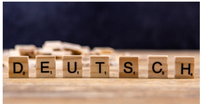
The German language

But in your everyday life German may also be important. Having good language skills will help you feel more at home in Germany. You will be able to settle in faster, take a more active part in life in Germany and make friends much more easily. In cities, it is usually easy to find services such as English-speaking doctors or events in English. However, when dealing with public authorities, you may find that not all staff have a very good command of English.