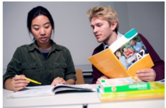
Students at Tandem learning

The Goethe Institut in Bangkok is still closed, but there are online courses offered on their website. We keep sharing ways to improve your #Deutsch via our Facebook and Twitter accounts!