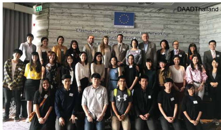
21 July 2018, Erasmus+ Pre-Departure Orientation & Networking 2018 @ The Westin Grand Sukhumvit, Bangkok One Thai student chooses Germany as the destination for his internship