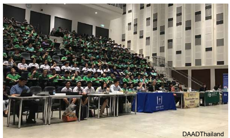
1 August 2018, Education Fair 2018 @ Kamnoetvidya Science Academy School, Rayong Not only students from KVIS, but other schools in the area came and joined the education fair.